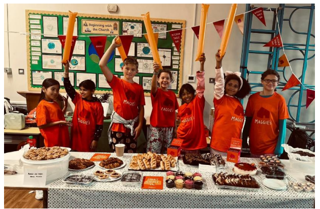
House Captains ready for the coffee morning.