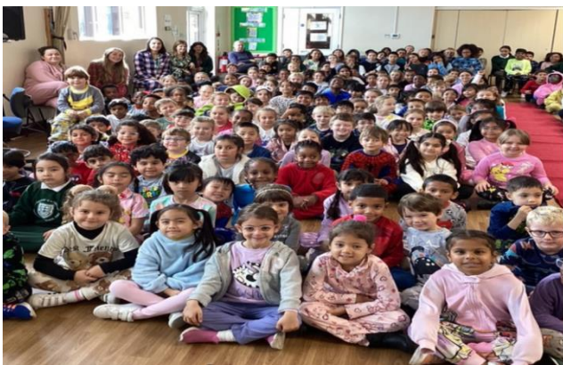
St Agnes in our PJ's!

Maggie's provides free cancer support and information in centres across the UK and online. The first Maggie's opened in Edinburgh in 1996. Our local centre is a brand new building at the Royal Free Hospital which is due to be completed by autumn 2023.